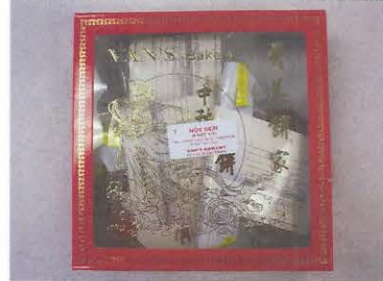
7 HOT SEN* (O Hot Vit) (Lotus bean paste filling)