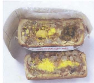
5 NGU NHAN DAC BIET (1 Hot Vit) (Nut mix with pork sausage filling with egg)