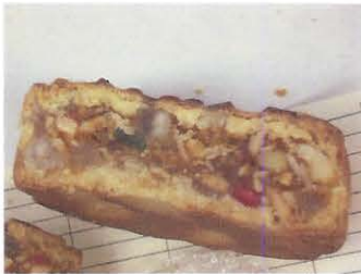
33 THAP CAM DAC BIET (0 Hot Vit) (Nut mix with pork sausage and ham filling)