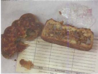
4 NGU NHAN DAC BIET (0 Hot Vit) (Nut mix with pork sausage filling)