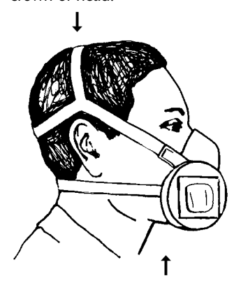
Respirator "cups" under chin.

A half-mask respirator fits about halfway up nose, snug but not pinching.