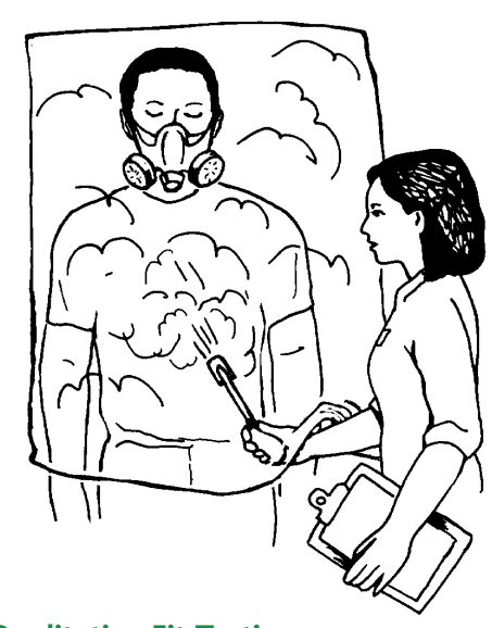
Qualitative Fit Testing– Simple and Inexpensive

Safety equipment suppliers (see yellow pages listing) or occupational health clinics can help select and fit test respirators. Employers can also buy a qualitative respirator fit testing kit from a safety equipment supplier.