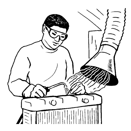
Local Exhaust Ventilation

Respirators may not be needed if you can reduce air lead levels by changing work practices, changing tools, or using local exhaust ventilation. Cal/OSHA requires that employers reduce high air lead levels (50 µg/M³ or higher) using these basic controls where possible. Respirators can be used until you have made these changes, and then afterwards if added protection is still needed.