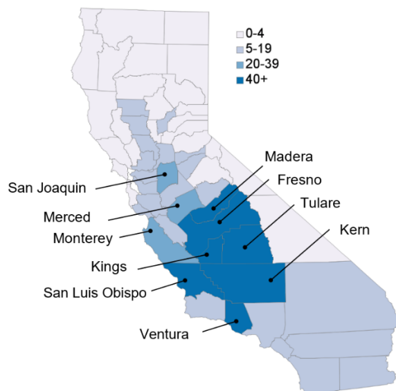
Valley Fever Rates, California, 2019

Rates of Valley fever cases reported per 100,000 population. Darkest colored counties had the highest rates of Valley fever.