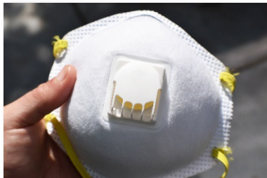
Disposable filtering facepiece respirator (N95)