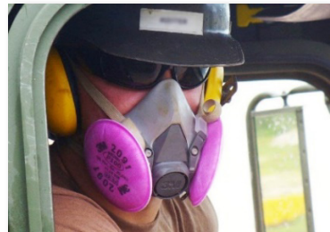
Elastomeric half-mask respirator