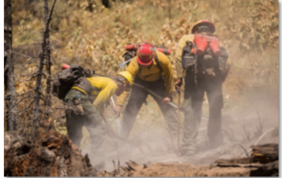
Digging a fire line disturbs soil that may contain cocci fungus

Valley fever (also called “coccidioidomycosis” or “cocci”) is a disease caused by the Coccidioides fungus that grows in the soil in some areas of California, especially the Central Valley and Central Coast. When soil that contains this fungus is disturbed or stirred up by digging, heavy equipment, or the wind, the fungus can get into the air. If people breathe in the fungus from dust in the air, it can infect the lungs causing cough, difficulty breathing, fever, and fatigue. Most people who breathe in the Valley fever fungus don’t have symptoms but, in rare cases, the fungus can spread to other parts of the body and cause severe disease. People with severe Valley fever may need to be hospitalized, causing weeks or months of missed work. In very rare cases, severe Valley fever can be fatal.