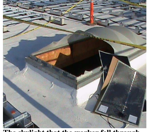
The skylight that the worker fell through

Guidance on working safely around skylights and electrical power lines can be found at: