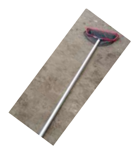
Exhibit 4. Poled net used for paddling the boat