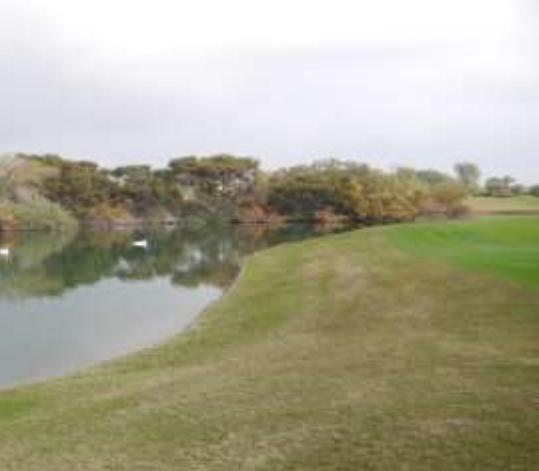
Exhibits 1 & 2: View of lake where the fatality occurred (landscape view not to scale; photo taken when lake was free of vegetation).