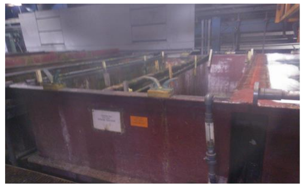
Exhibit 2. The chrome plating tanks.