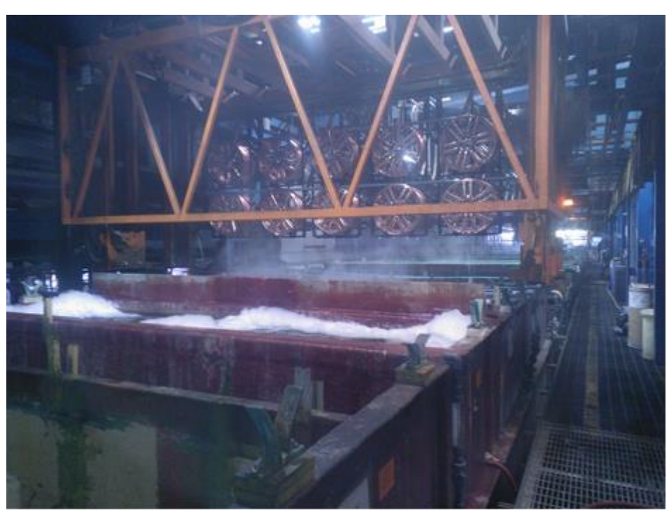
Exhibit 3. The computer controlled hoist with an attached cage for the wheels.