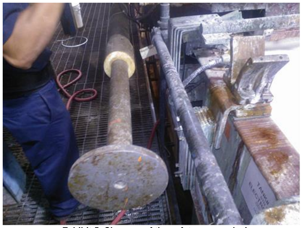
Exhibit 5. Close-up of the safety sensor device.