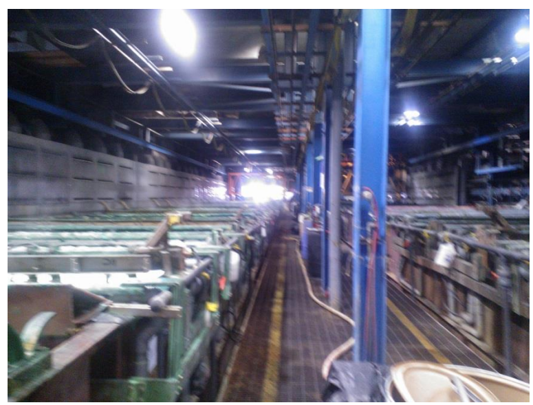
Exhibit 1. The chrome plating area of the business.

The scene of the incident was the chrome plating shop for automotive wheels (Exhibit 1).