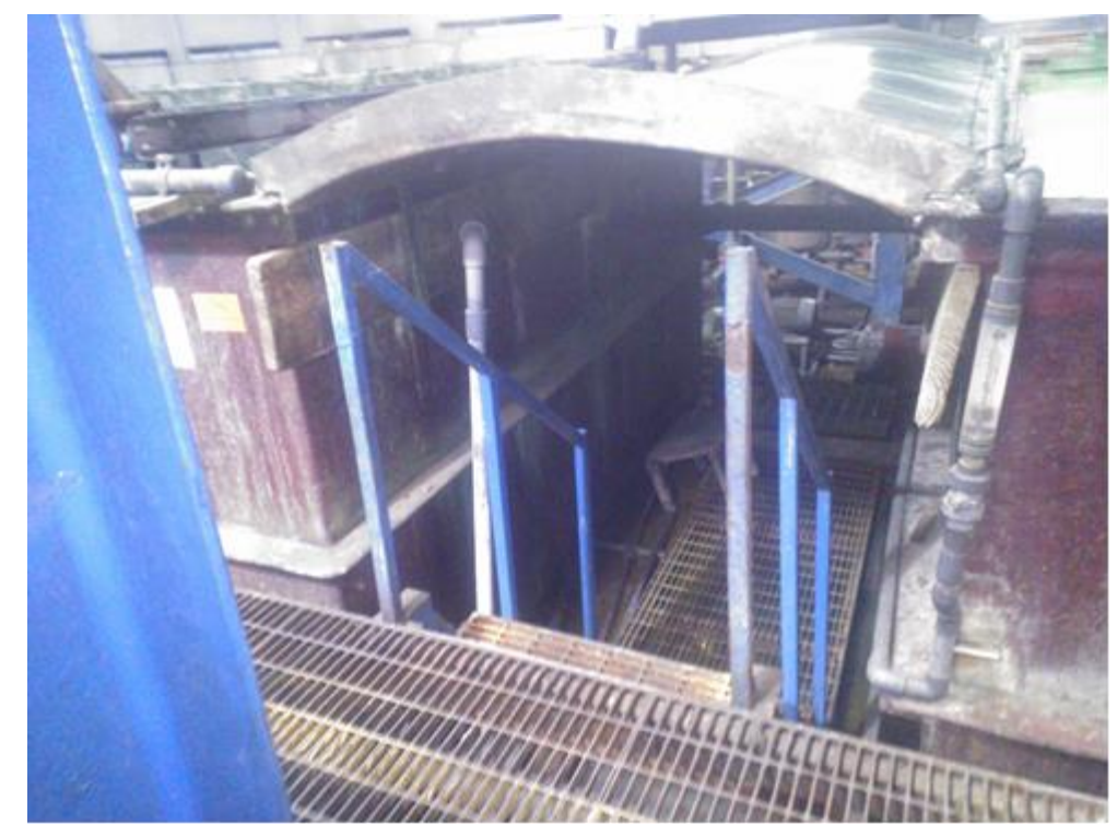
Exhibit 6. The entrance to the chrome plating tanks in the middle of the row.