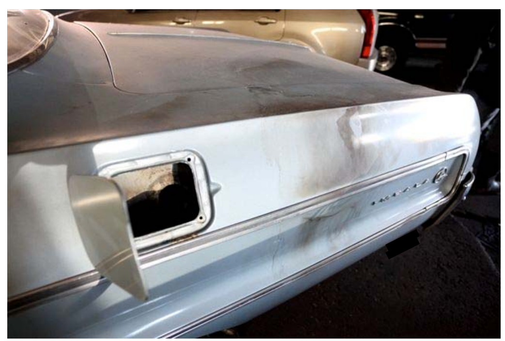
Exhibit 6 - The vehicle's fuel tank inlet.