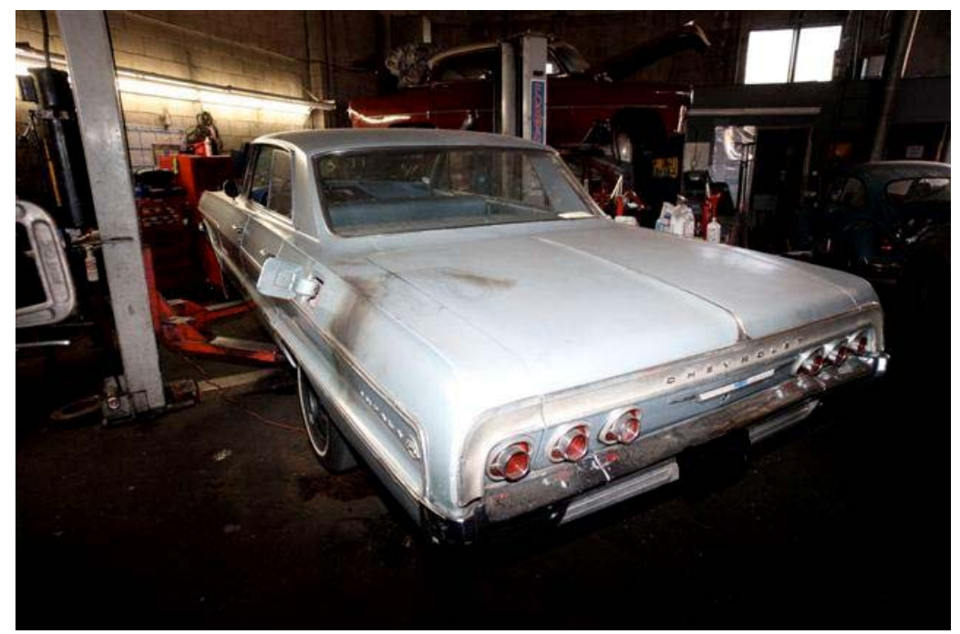
Exhibit 5 - The vehicle involved in the incident.