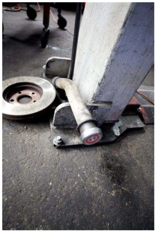
Exhibit 9. The gas tank filler hose.