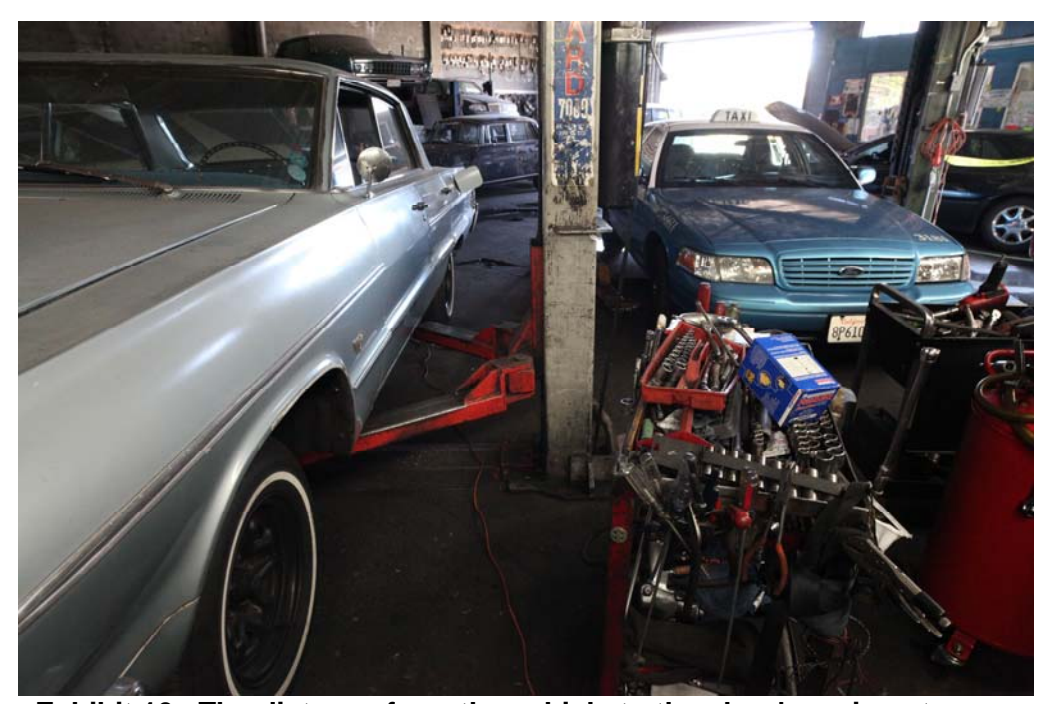
Exhibit 10. The distance from the vehicle to the shop's main entrance.