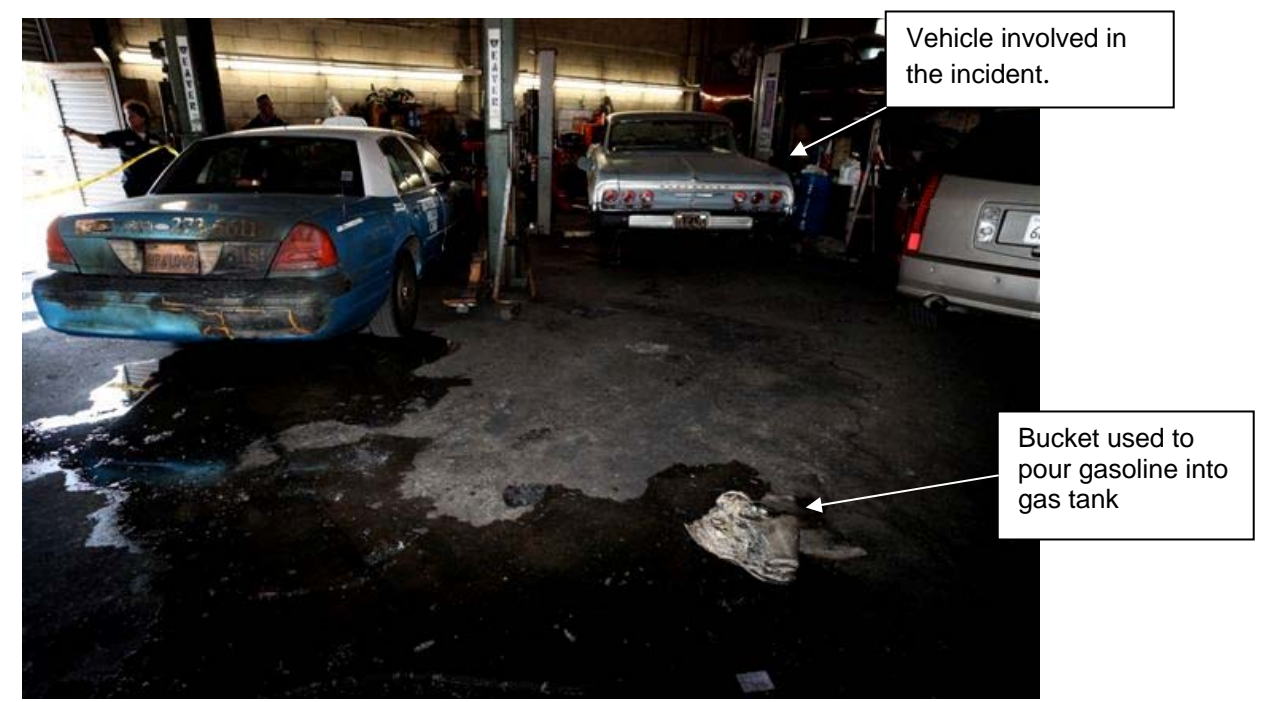
Exhibit 3. The vehicle involved in the incident.