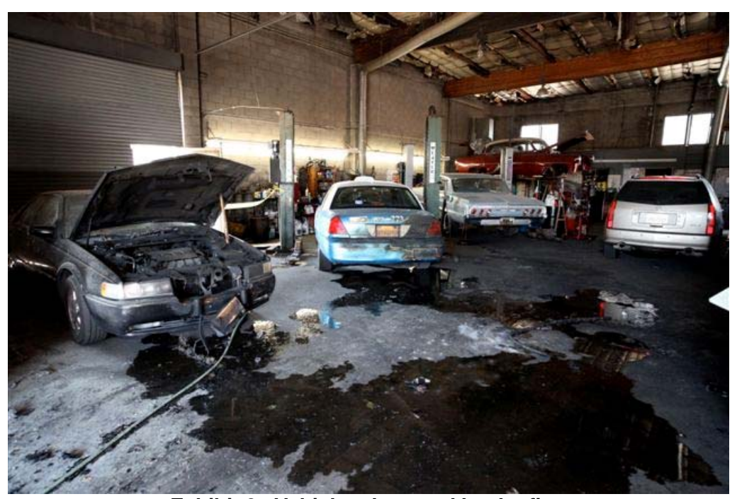
Exhibit 2. Vehicles damaged by the fire.