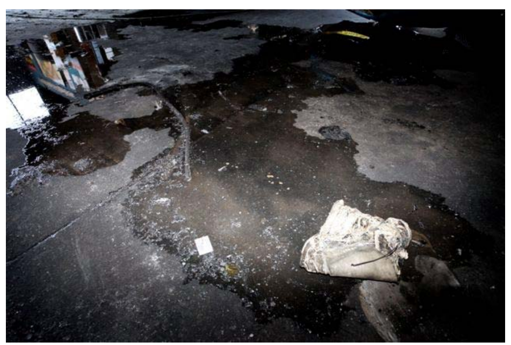
Exhibit 4 - The remains of the bucket used to pour gasoline into the vehicle.