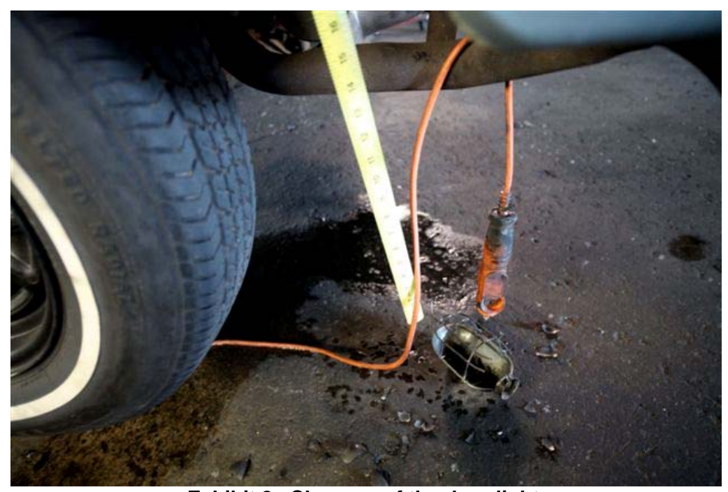
Exhibit 8. Close-up of the drop light.