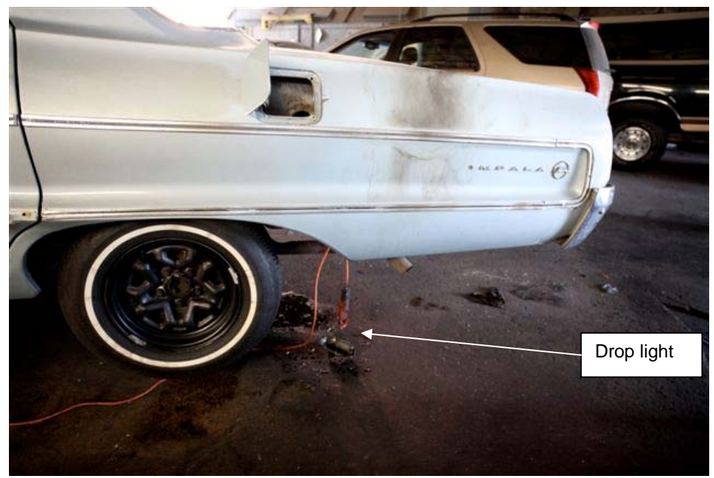
Exhibit 7. The drop light that was left hanging under the vehicle when the automotive lift was lowered.