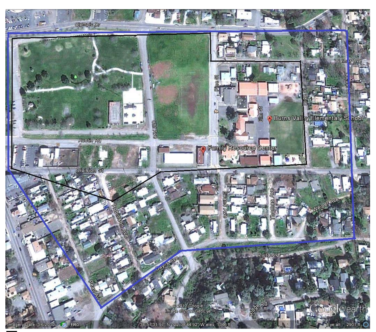
Figure 1. Investigation Boundary, Burns Valley Neighborhood