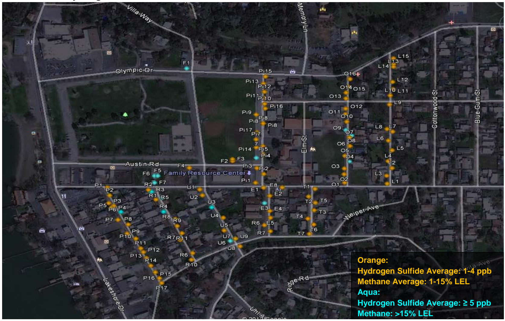
California Department of Public Health • March 2013

Figure 3.Sampling Locations and Average Ground Level Concentrations of Hydrogen Sulfide and Methane Measured in the Burns Valley Neighborhood Between June 25-29, 2012