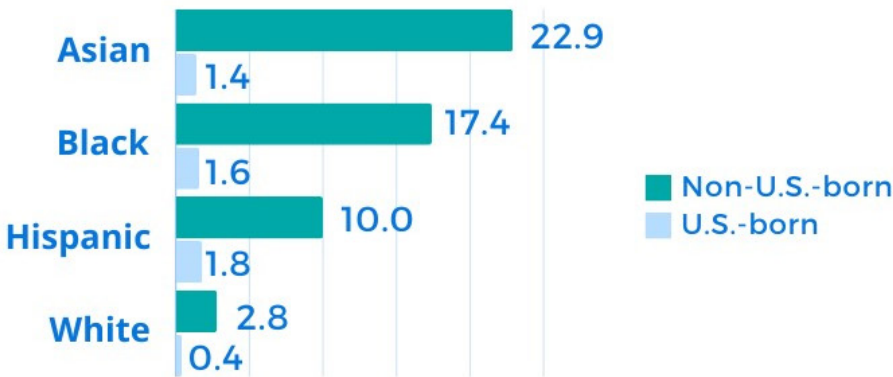
TB incident rate per 100,000 persons, 2022