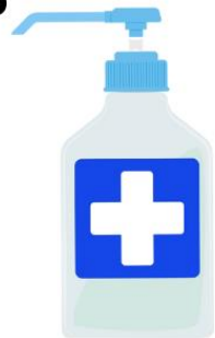
Alcohol-Based Hand Rub (ABHR)