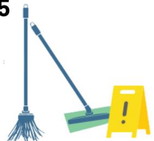
Mops & Wet Floor Sign