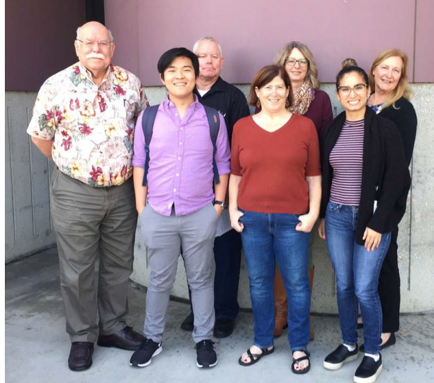
Southern California Regional SIDS Council February 20, 2020