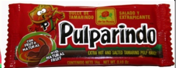
De La Rosa Pulparindo (Extra Hot)