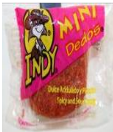
Indy Mini Dedos Spicy & Sour Recalled on: January 18, 2008