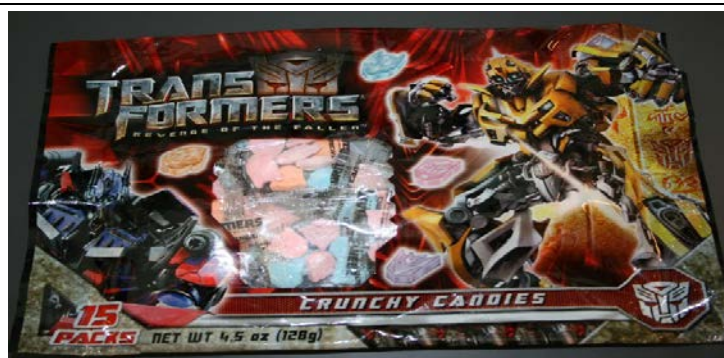
Au`SomeTrans Formers 'Revenge of the Fallen' TM Crunchy Candy Effective 9/28/2010 This candy IS ALLOWED FOR SALE IN California, EXCEPT FOR LOT # 09168 Recalled on: August 6, 2010