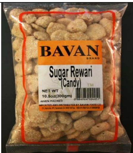
BAVAN Brand Sugar Rewari Imported from India Recalled on: June 30, 2011