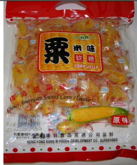
Corn Jelly / Choice American Sweet Corn Flavour Recalled on: May 4, 2010