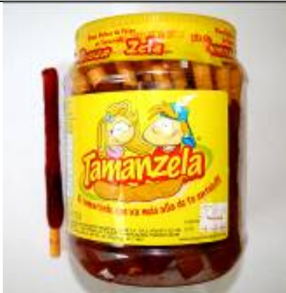
Tamazela, Chili covered Lollipop Recalled on: February 6, 2008