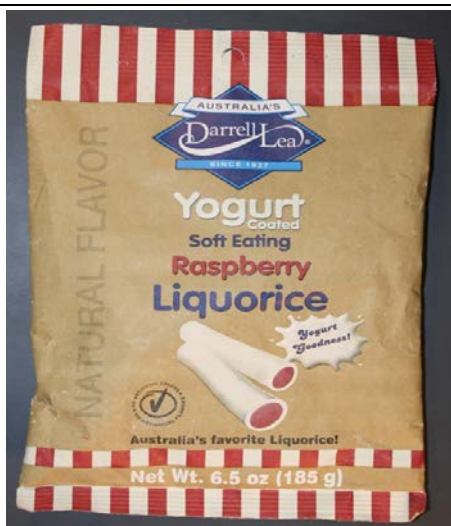
Australia's Darrell Lea Yogurt Coated Soft Eating Raspberry Liquorice Recalled on: March 17, 2010