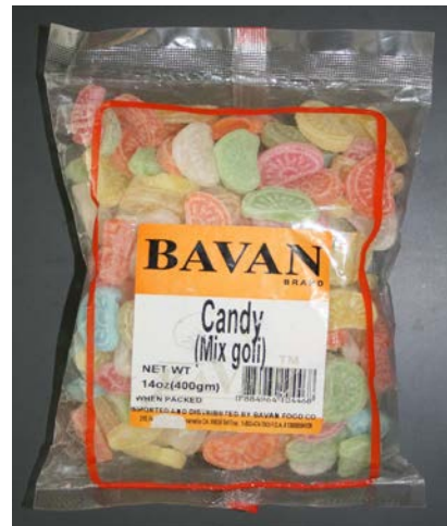
BAVAN Brand Mix Goli Recalled on December 1, 2011