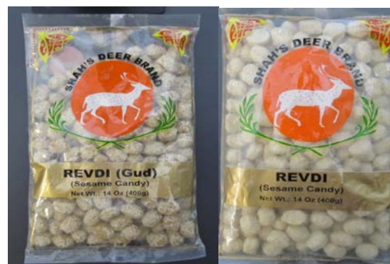
Shah's Deer Brand Revdi (Gud) (Sesame Candy) and Shah's Deer Revdi (Sesame Candy) from India Both Candies Recalled on: March 5, 2012

THE INFORMATION CONTAINED IN THIS DOCUMENT IS SUBJECT TO FREQUENT CHANGE WITHOUT PRIOR NOTICE. The information is effective and accurate only as of the "Last Updated" date at the top of the page, and is only valid until next updated. Enforcement actions taken solely on the basis of information contained in this document may not be valid. Candies may be re-tested at any time and found to contain <0.10 ppm lead, which would then allow those candies to be sold in California.