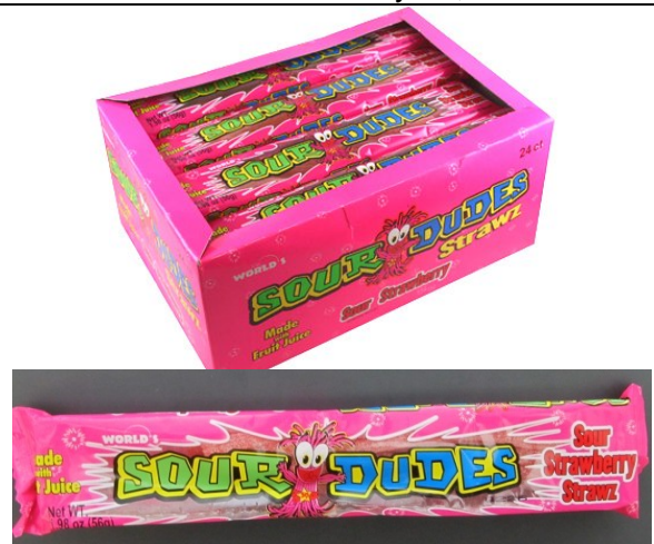
World's Sour Dudes Sour Strawberry Strawz Recalled on: August 30, 2012

THE INFORMATION CONTAINED IN THIS DOCUMENT IS SUBJECT TO FREQUENT CHANGE WITHOUT PRIOR NOTICE. The information is effective and accurate only as of the "Last Updated" date at the top of the page, and is only valid until next updated. Enforcement actions taken solely on the basis of information contained in this document may not be valid. Candies may be re-tested at any time and found to contain <0.10 ppm lead, which would then allow those candies to be sold in California.