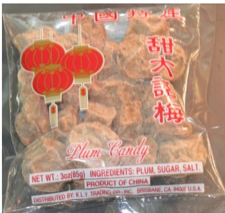
Red Lantern Plum Candy From China/ K.Y.L. Trading Co., Inc. Recalled on: October 16, 2012