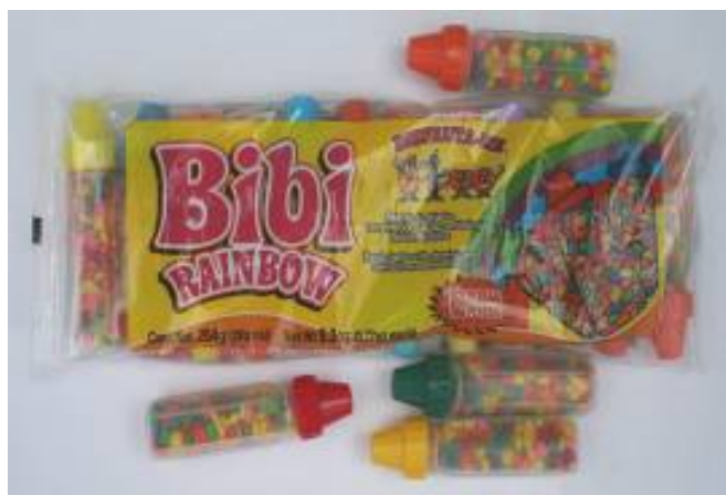
Bibi Rainbow Chewing Gum Recalled on: February 6, 2008