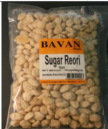
BAVAN Brand Sugar Reori Imported from India Recalled on: December 29, 2010

THE INFORMATION CONTAINED IN THIS DOCUMENT IS SUBJECT TO FREQUENT CHANGE WITHOUT PRIOR NOTICE. The information is effective and accurate only as of the "Last Updated" date at the top of the page, and is only valid until next updated. Enforcement actions taken solely on the basis of information contained in this document may not be valid. Candies may be re-tested at any time and found to contain <0.10 ppm lead, which would then allow those candies to be sold in California.