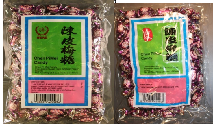
Chen Pi Mei Candy & SENG Chen Pi Mei Candy Recalled on: December 31, 2009 / Recalled on: June 6, 2009

THE INFORMATION CONTAINED IN THIS DOCUMENT IS SUBJECT TO FREQUENT CHANGE WITHOUT PRIOR NOTICE. The information is effective and accurate only as of the "Last Updated" date at the top of the page, and is only valid until next updated. Enforcement actions taken solely on the basis of information contained in this document may not be valid. Candies may be re-tested at any time and found to contain <0.10 ppm lead, which would then allow those candies to be sold in California.