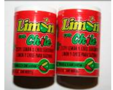
Lucas Limon and Lucas Limon con Chile Note: The manufacturer has discontinued these products. Recalled on: May 9, 2007