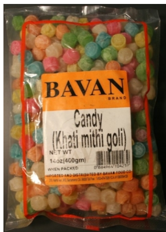
BAVAN Brand Santra Goli and BAVAN Khati Mithi Goli Imported from India Recalled on: January 28, 2011