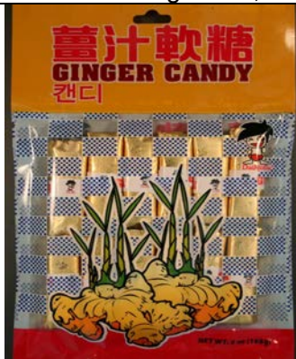
DaiJyo Bu Ginger Candy from China Recalled on: September 21, 2010