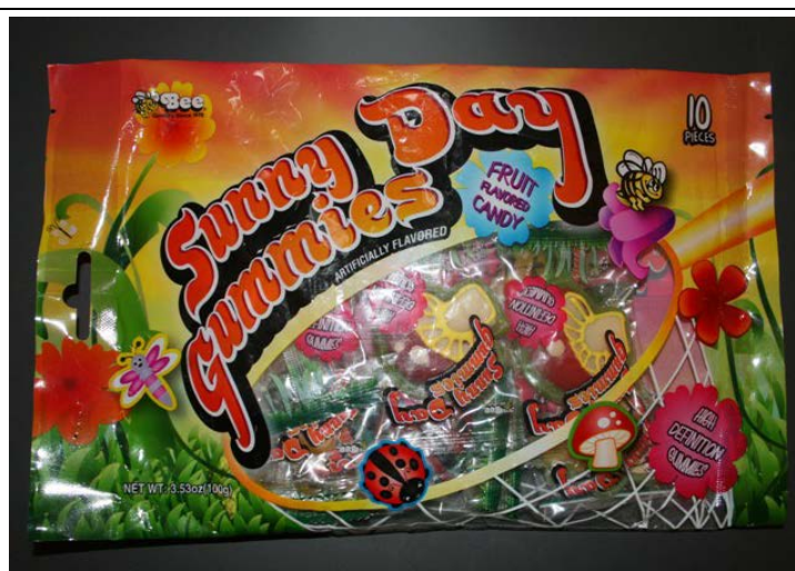
Bee Brand Sunny Day Gummies Recalled on: December 1, 2011