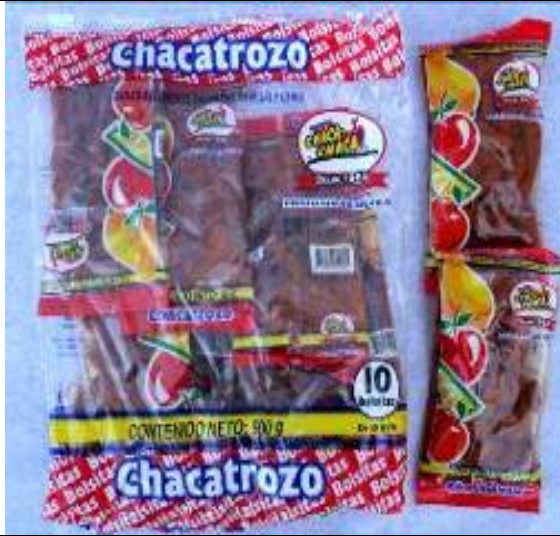
Chaca Chaca Chacatrozo Recalled on: April 17, 2008