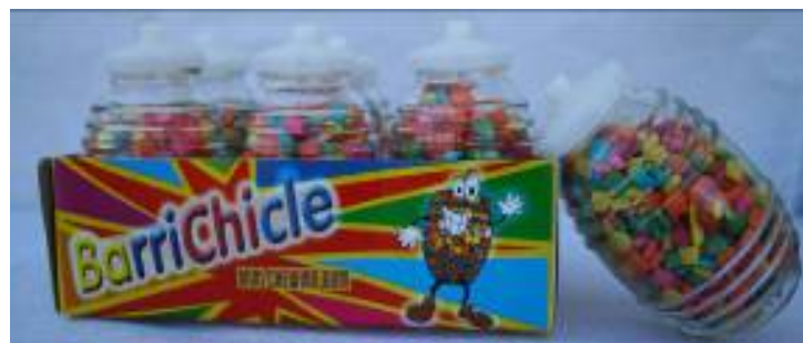
BarriChicle Chewing Gum Recalled on: March 11, 2008

THE INFORMATION CONTAINED IN THIS DOCUMENT IS SUBJECT TO FREQUENT CHANGE WITHOUT PRIOR NOTICE. The information is effective and accurate only as of the "Last Updated" date at the top of the page, and is only valid until next updated. Enforcement actions taken solely on the basis of information contained in this document may not be valid. Candies may be re-tested at any time and found to contain <0.10 ppm lead, which would then allow those candies to be sold in California.