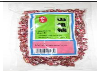
Hawthorn Candy Recalled on: October 3, 2008