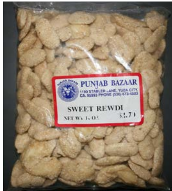
Punjab Bazaar Rewari Gur Jaggery & Punjab Bazaar Sweet Rewdi / from India Both Candies Recalled on: November 17, 2011