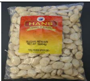
Hans Sugar Rewari/ Imported from India Recalled on: November 17, 2011