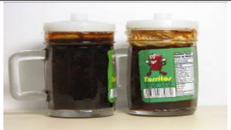
Tarritos, Liquid Candy Snack Recalled on: February 6, 2008

THE INFORMATION CONTAINED IN THIS DOCUMENT IS SUBJECT TO FREQUENT CHANGE WITHOUT PRIOR NOTICE. The information is effective and accurate only as of the "Last Updated" date at the top of the page, and is only valid until next updated. Enforcement actions taken solely on the basis of information contained in this document may not be valid. Candies may be re-tested at any time and found to contain <0.10 ppm lead, which would then allow those candies to be sold in California.