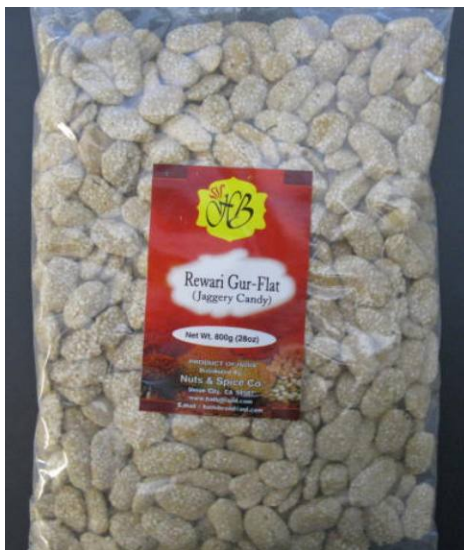
HB Rewari Gur-Flat (Jaggery Candy)/ from India Recalled on: February 16, 2012