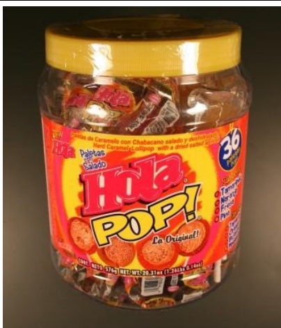
Hola Pop La Original Lollipop Candy Recalled on: May 2, 2009