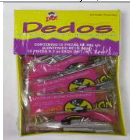
Indy Dedos, Spicy & Sour Effective 12/19/07 – This candy bearing a two-line lot code may be sold in California.