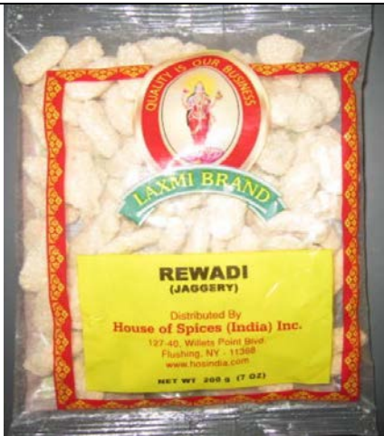
Laxmi Brand Rewadi (Jaggery)/ from India Recalled on: February 16, 2012