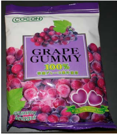
Cocon® Grape Gummy 100% Candy Recalled on: August 27, 2010