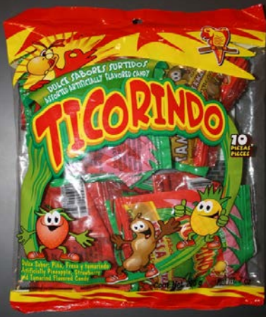
Ticorindo Candy Recalled on December 31, 2009