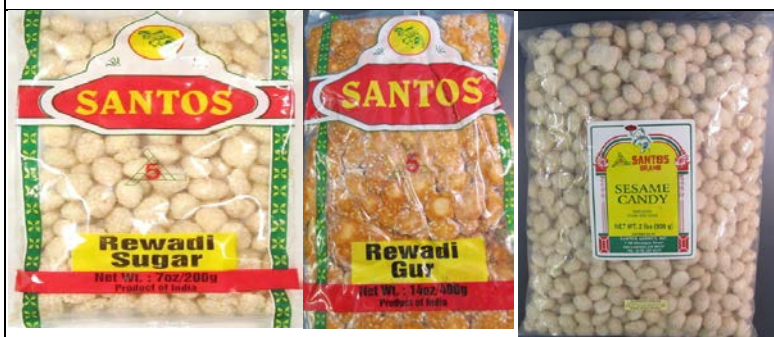
Santos Candies from India: Rewadi Sugar Recalled on: September 13, 2013 and Rewadi Gur, and Santos Sesame Candies Recalled on: October 7, 2013