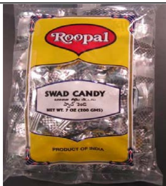
Roopal Swad Candy / from India Recalled on: November 18, 2011