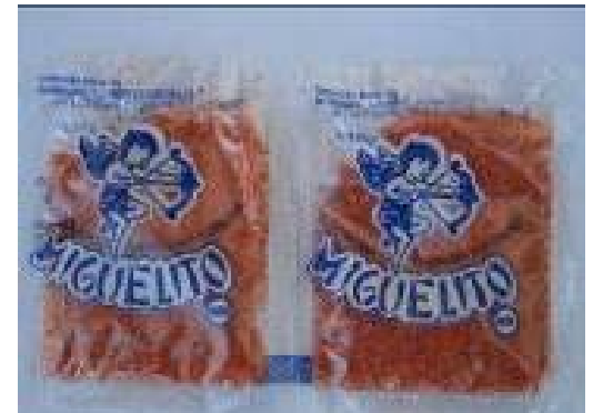
Miguelito Recalled on: August 22, 2007

THE INFORMATION CONTAINED IN THIS DOCUMENT IS SUBJECT TO FREQUENT CHANGE WITHOUT PRIOR NOTICE. The information is effective and accurate only as of the "Last Updated" date at the top of the page, and is only valid until next updated. Enforcement actions taken solely on the basis of information contained in this document may not be valid. Candies may be re-tested at any time and found to contain <0.10 ppm lead, which would then allow those candies to be sold in California.