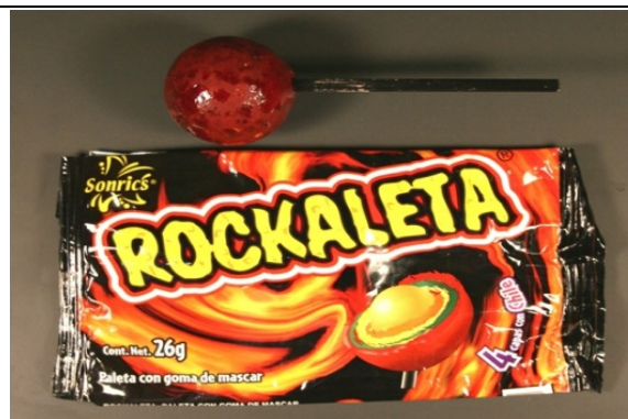
Sonrics Rockaleta with Chili and Mango Flavored Gum Center Effective August 11, 2011: This candy bearing a 'code' of: 122K163 or greater (for example 122K164, 134J001, etc.) is allowed for sale in California Note: No recall issued/ Product not distributed in commerce.