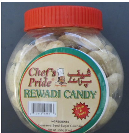
Chef's Pride Rewadi Candy/ Imported from Pakistan Recalled on: March 5, 2012