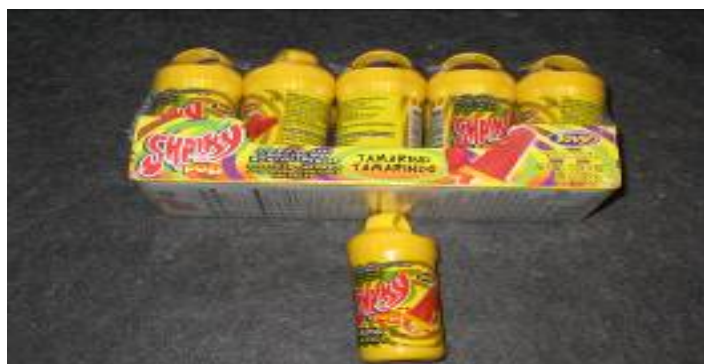
Jovy Shaiky Pop Recalled on: September 7, 2007