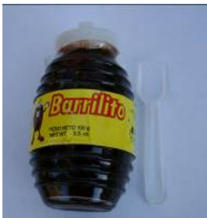
Barrilito Recalled on: August 22, 2007