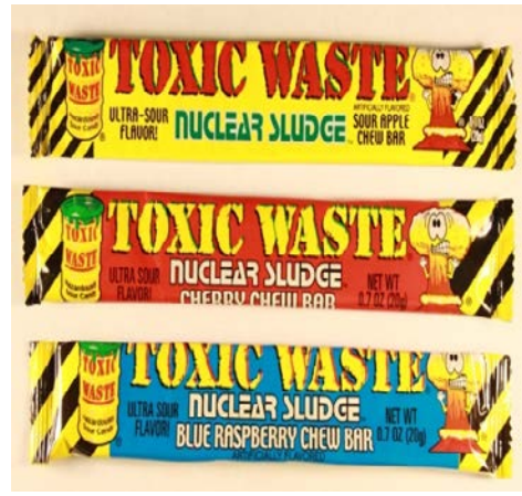
Toxic Waste Brand Nuclear Sludge Bar (various flavors) Please Note: Extended Recall only applies to the Nuclear Sludge candies and not to other 'Toxic Waste' Brand candies. Recalled on: January 14, 2011