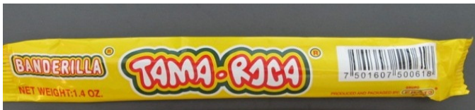
Tama Roca Banderilla Recalled on: May 9, 2007

Tama-Roca Banderilla can now be sold in CA effective May 23, 2013 with the new lot code of 13 YYMMDD