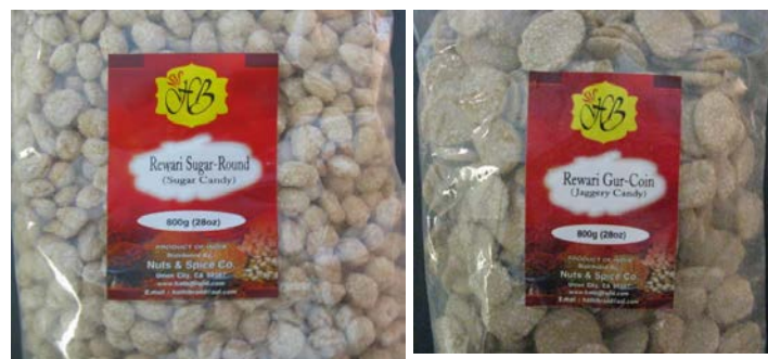
HB Rewari: Sugar-Coin, Sugar Flat, Sugar Round & Gur-Coin (Jaggery Candy) Candy/ All Imported from India Recalled on: February 23, 2012

THE INFORMATION CONTAINED IN THIS DOCUMENT IS SUBJECT TO FREQUENT CHANGE WITHOUT PRIOR NOTICE. The information is effective and accurate only as of the "Last Updated" date at the top of the page, and is only valid until next updated. Enforcement actions taken solely on the basis of information contained in this document may not be valid. Candies may be re-tested at any time and found to contain <0.10 ppm lead, which would then allow those candies to be sold in California.