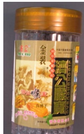
Jigong Chayote Recalled on: October 23, 2009