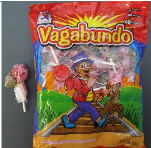
Vagabundo Paletas Candy Recalled on: March 30, 2012