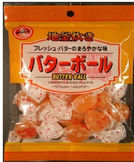
Butter Ball Candy Recalled on: December 13, 2010

THE INFORMATION CONTAINED IN THIS DOCUMENT IS SUBJECT TO FREQUENT CHANGE WITHOUT PRIOR NOTICE. The information is effective and accurate only as of the "Last Updated" date at the top of the page, and is only valid until next updated. Enforcement actions taken solely on the basis of information contained in this document may not be valid. Candies may be re-tested at any time and found to contain <0.10 ppm lead, which would then allow those candies to be sold in California.