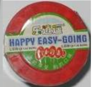
Qi Cai Bang Recalled on: June 18, 2008