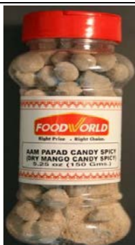
AAM PAPAD Candy Spicy By Food World Recalled on: July 1, 2010