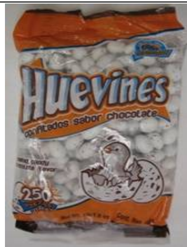
Huevines Confitados Sabor Chocolate Recalled on: July 31, 2008