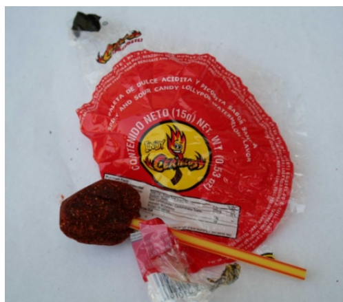
Indy Cerillos, Watermelon Flavor Effective 12/19/07 – This candy bearing a two-line lot code may be sold in California. For example: