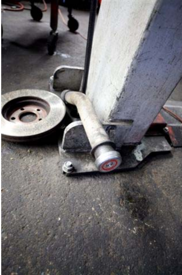
Exhibit 9. The gas tank filler hose.