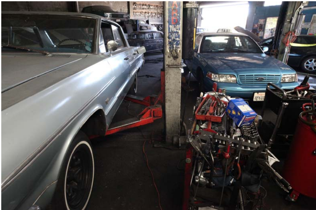
Exhibit 10. The distance from the vehicle to the shop's main entrance.