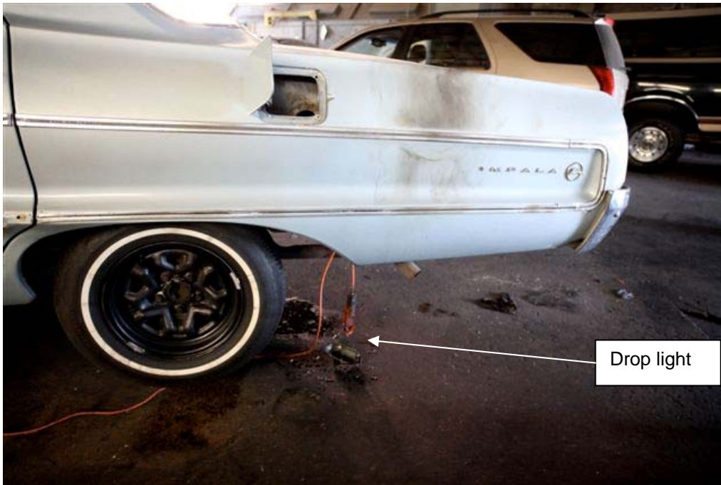
Exhibit 7. The drop light that was left hanging under the vehicle when the automotive lift was lowered.