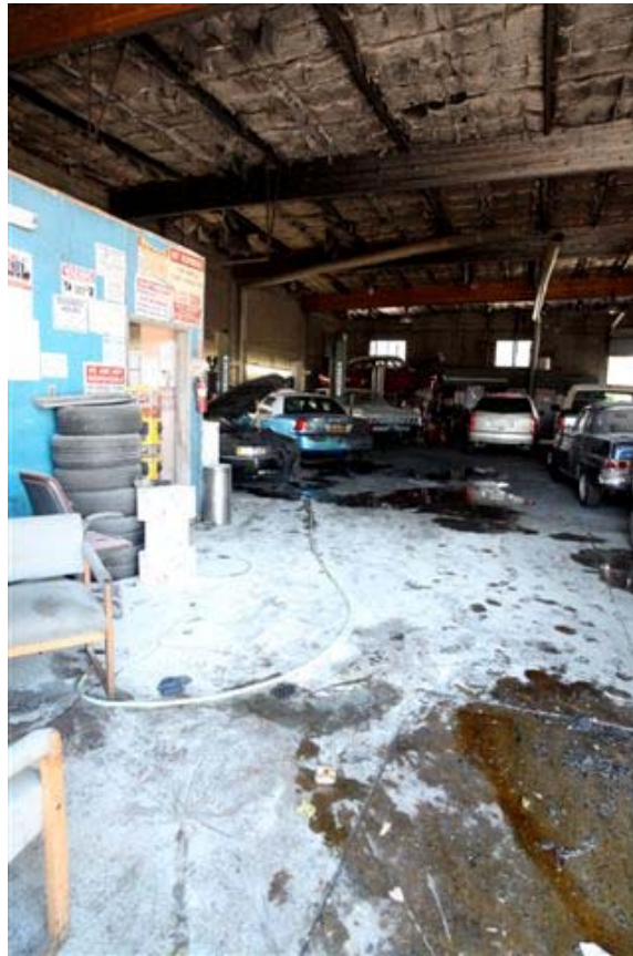
Exhibit 1 - The incident scene viewed from the entrance to the shop.