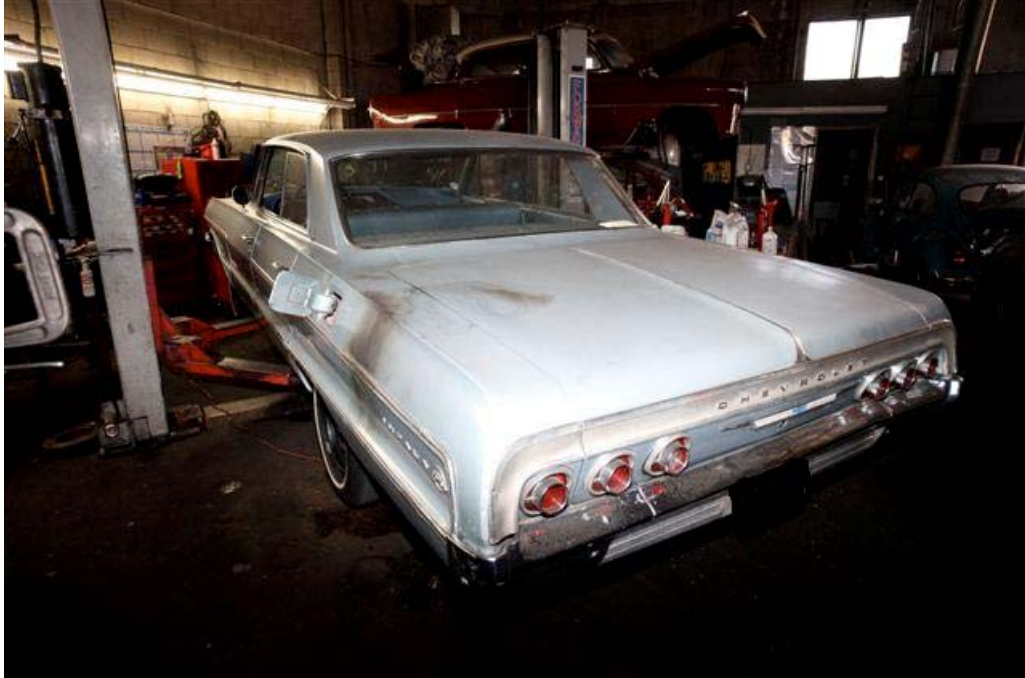
Exhibit 5 - The vehicle involved in the incident.