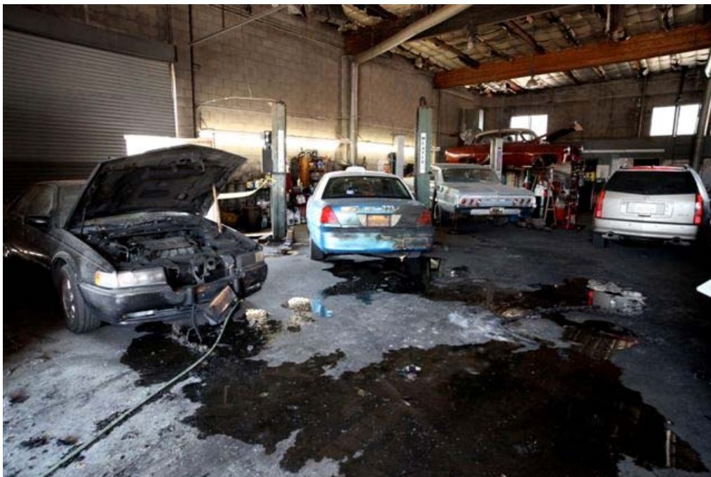
Exhibit 2. Vehicles damaged by the fire.