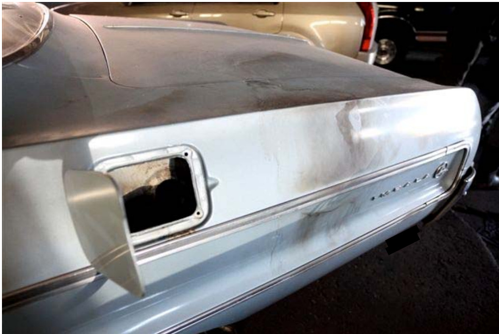
Exhibit 6 - The vehicle's fuel tank inlet.