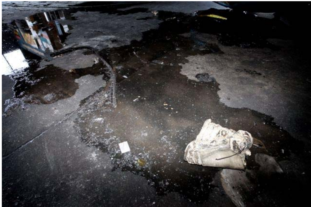
Exhibit 4 - The remains of the bucket used to pour gasoline into the vehicle.