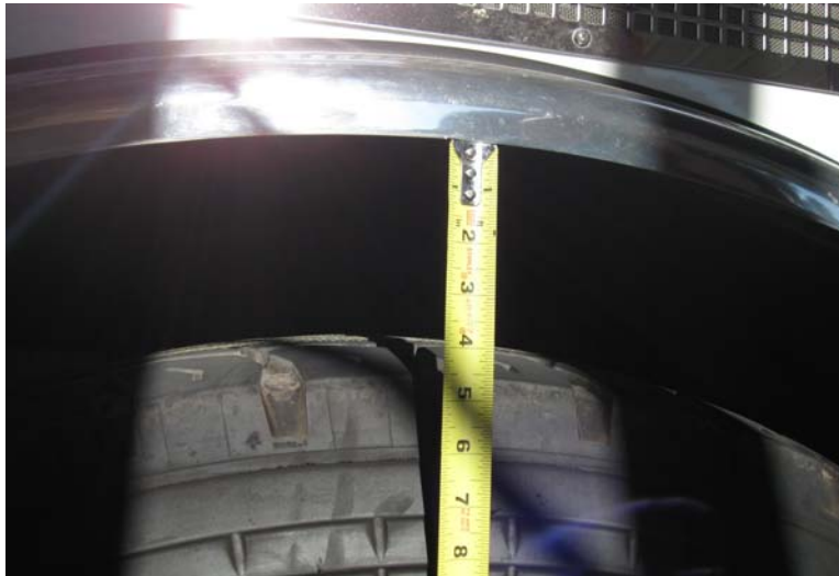
Exhibit #5. The distance between the tire and fender of the cab was approximately 4.5 inches.