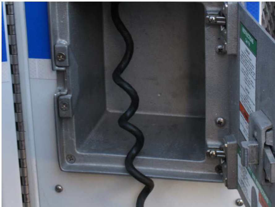
Exhibit 2. The storage area for the control box showing the spiral cord that attaches to the control box.