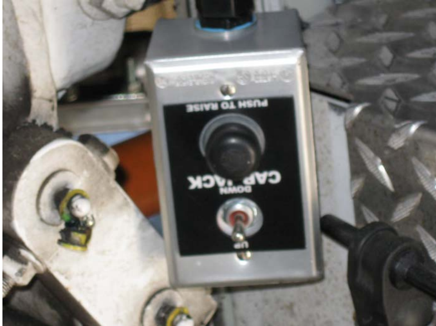
Exhibit 1. The control box used to raise and lower the cab.