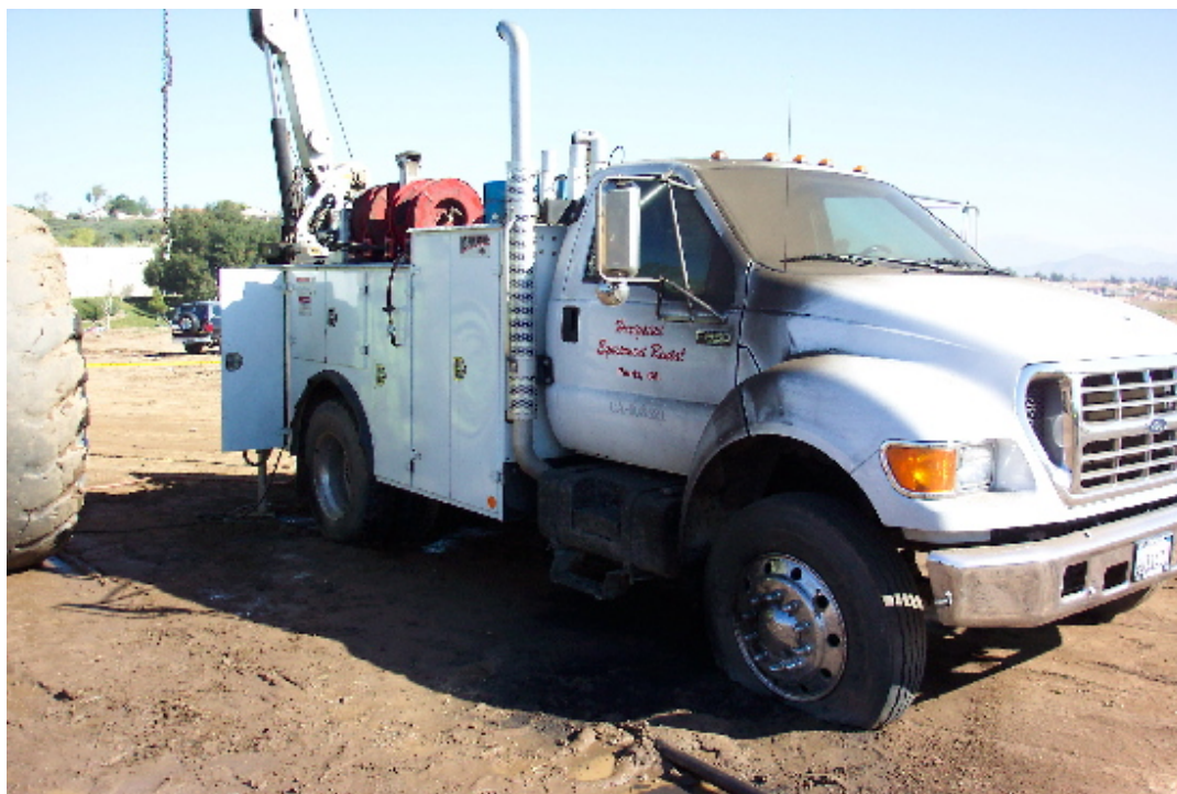
Exhibit 3. The victims' truck with the boom that made contact with the high voltage lines.