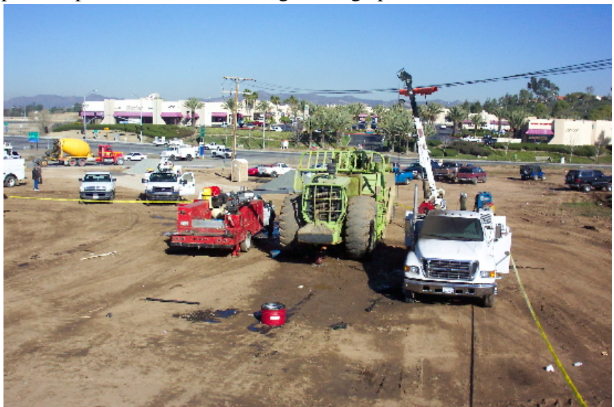
Exhibit 1. A view of the construction site and equipment involved in this incident.

contained 12,000 volts of electricity (12 kv) and ran directly through the construction site. The victims arrived at the incident site and parked their trucks approximately four feet away on opposite sides of the scraper. The victims disconnected and removed the rear differential from the scraper using the truck-mounted crane on one of the trucks to lift it out of the scraper. The controls for the truck crane were portable and connected to the truck by an