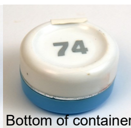
Bottom of container