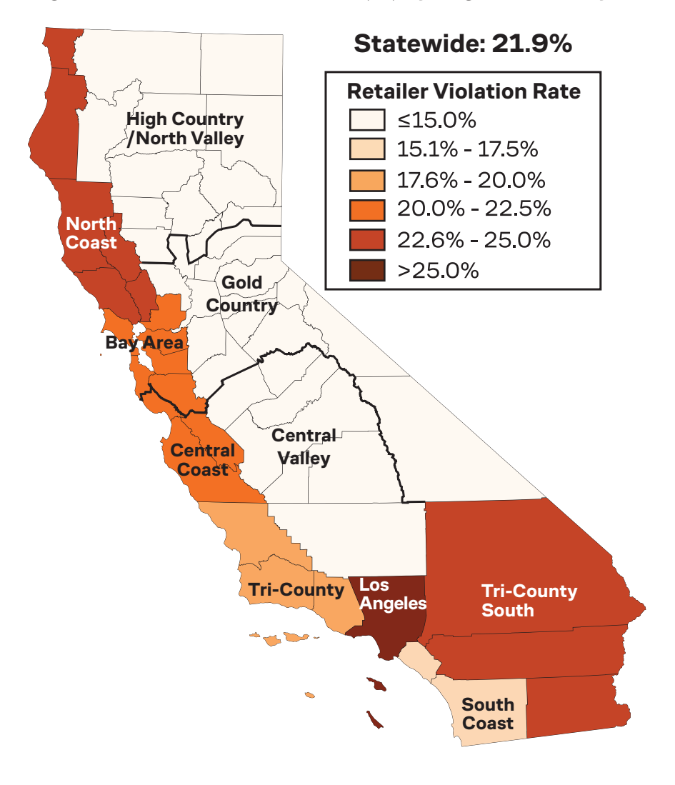
Figure 2. Retailer Violation Rate (%) by Region, 2023 Synar Tobacco Purchase Survey

Notes: Weighted percentages (%) are shown. Prepared by: California Department of Public Health, California Tobacco Prevention Program on July 2023.