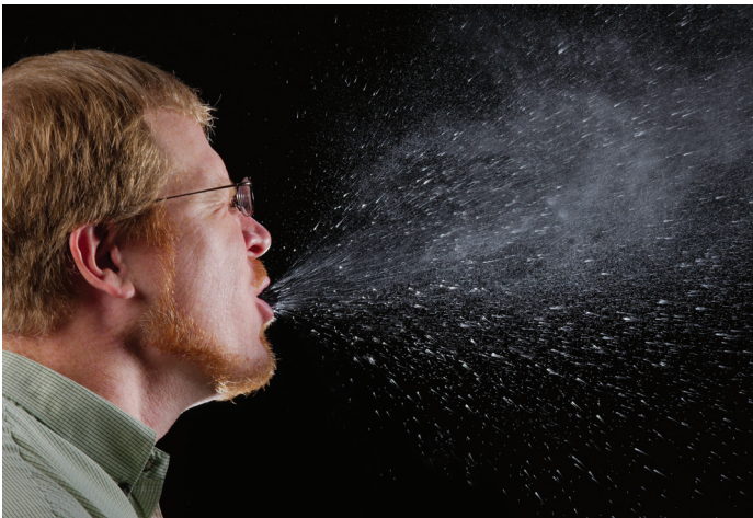
Photo enhanced to make airborne droplets visible

Health care workers who care for patients with ATDs must work in close proximity to the source of the hazard, so even if the room has enhanced ventilation, they are likely to have a higher risk of inhaling infectious aerosols (droplets and particles) than the general public. Exposure of