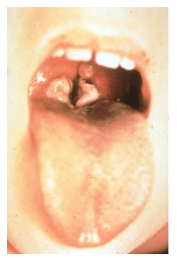
Figure 1. Images of symptoms Pseudomembrane over the tonsils

usually result in bleeding. The membrane may progressively extend into the larynx and trachea and cause airway obstruction, which, if left untreated, can be fatal. Swelling of the cervical lymph nodes and soft tissue can lead to a "bullneck" appearance in moderate to severe disease (Figure 1, right). Absorption of diphtheria toxin from the site of infection can cause systemic complications, including damage to the myocardium, nervous system, and kidneys. See <a href="CDC webpage">CDC webpage</a> for a list of considerations when respiratory diphtheria is suspected.