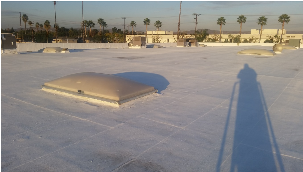
Exhibit 1. The flat roof of the warehouse showing the skylights and AC units.