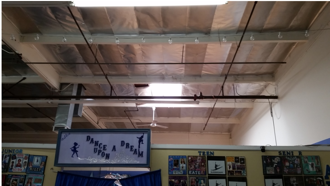
Exhibit 3. The dance studio theme room skylight opening involved in this incident.