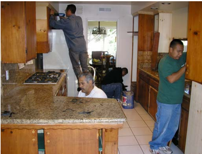
Figure 6-1. Preparing Kitchen for Stripping

A picture of a contractor preparing a kitchen for stripping is shown in Figure 6-1. The stripping formulations used for this type of stripping activity are fairly viscous since they must strip vertical services. The baseline stripper, in this case, was a METH stripper called Lifteeze Paint & Varnish Remover. An MSDS for this stripper is shown in Appendix E. The stripper contains METH, methanol, acetone and toluene. Other strippers containing NMP might also be used for this purpose.