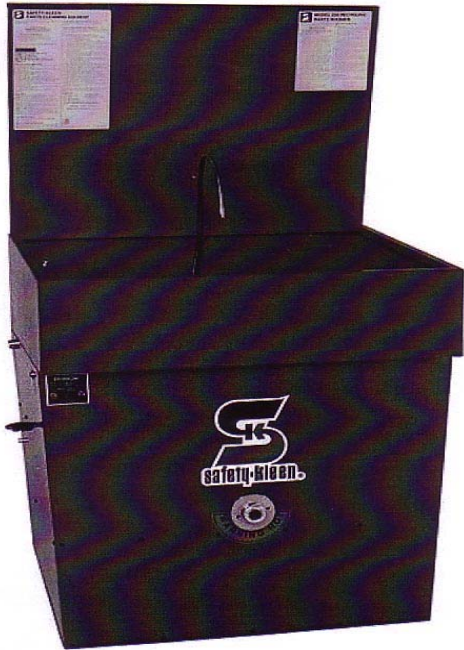
Figure 2-2. D5 Cleaning System