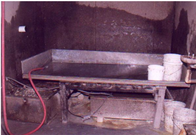
Figure 6-6. Typical Water Wash Booth

When the worker is finished stripping the item, it is transferred from the flow tray to the water wash booth. A picture of a typical water wash booth is shown in Figure 6-6. High pressure wands containing water and oxalic acid are used to rinse the remaining stripper and coating residue from the item. The oxalic acid is used to brighten the wood surface.