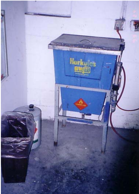
Figure 3-6. Spray Gun Cleaner at Autobody Shop #2

Case Study for Autobody Shop #2. Autobody Shop #2, like Autobody Shop #1, is located in Santa Monica, California. The company repairs cars and, as part of that activity, they paint them. The shop uses an enclosed spray gun cleaner that belongs to the facility to clean the HVLP spray guns that are used to apply the coatings. A picture of this spray gun cleaner is shown in Figure 3-6. The cleaner used by the company is lacquer thinner which would not comply with the VOC limit for cleaners today.