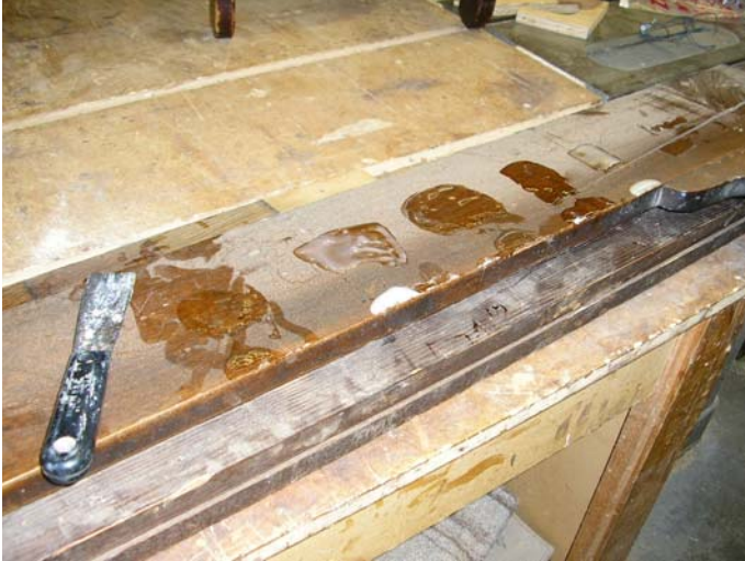
Figure 6-3. Bed Rail After Applying Five Strippers