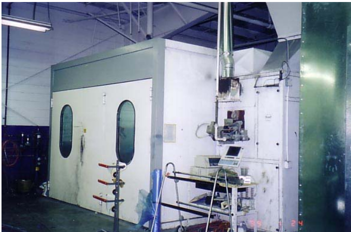
Figure 3-1. Outside of Typical Spray Booth

Refinishing may be done on a spot, a panel or the entire vehicle. Spot repair and paint work is generally performed on a small damaged area. Panel repair is similar except that the work area is larger and may include a hood or a door, for instance. The entire vehicle could be repainted because the paint is faded or a different color is requested. The repair work would generally include the physical repair of the damaged area, conditioning of substrate and application of undercoats and topcoats. Two views of a typical spray booth in an autobody shop are shown in Figure 3-1 and Figure 3-2.