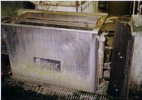
Figure 4-3. Cleaning System at Plating Company

The plating company used a PERC vapor degreaser to clean all of the parts. IRTA began working with the company to identify, test and implement a water-based cleaning system as an alternative to the PERC degreaser. After testing parts containing a buffing compound, a water-based cleaning agent that is effective in removing the compound was selected. The company purchased an ultrasonic water-based cleaning system to clean the parts. A picture of the new ultrasonic system is shown in figure 4-3. The company converted to a water-based process for the parts on the custom line which are cleaned on plating fixtures. The vapor degreaser was still used for the parts on the automated line until the company installed a hoist so the parts from the automated line could be cleaned in baskets in the ultrasonic cleaning system.