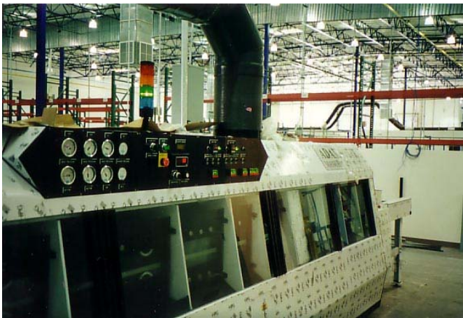
Figure 4-4. Conveyorized Printed Circuit Board Cleaning System

There are several types of flux that can be used to prepare for the soldering operation. First, some companies use low solids flux (sometimes called no-clean flux) that does not require removal with any cleaning agent. Conversion to low solids flux that does not have to be removed is one alternative to using NPB for flux removal. Second, water soluble fluxes are widely available and are used routinely by many companies. This type of flux can be removed with plain deionized (D.I.) water. Third, water-based cleaners called saponifiers can be used to remove traditional rosin based flux. The process involves using a formulated water cleaner and rinsing the boards with D.I. water. In both types of water cleaning, dryers are used to dry the boards after cleaning. A typical water cleaning conveyORIZED board cleaning system is shown in Figure 4-4.