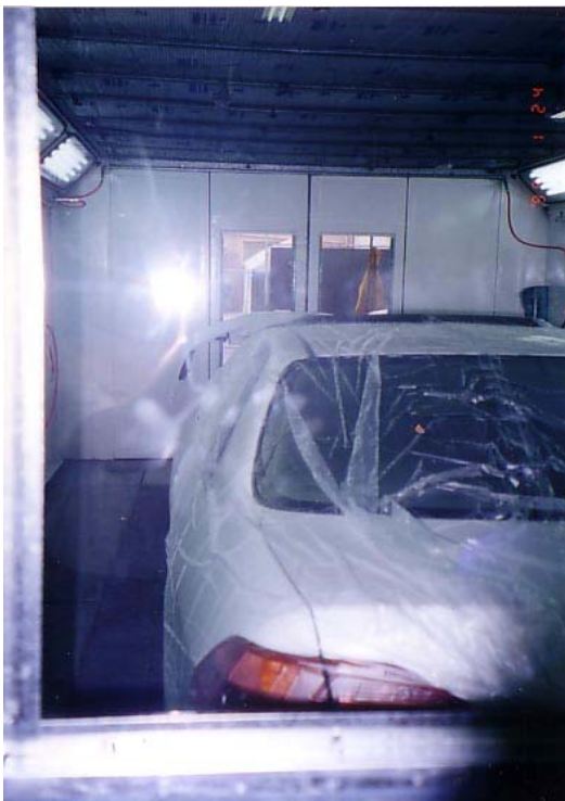
Figure 3-2. Inside of Typical Spray Booth