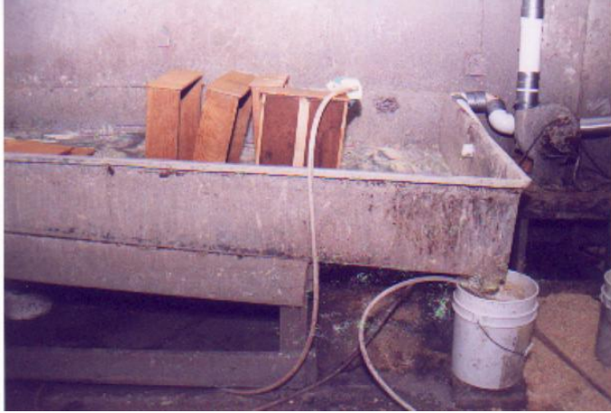
Figure 6-5. Typical Flow Tray

When the worker is finished stripping the item, it is transferred from the flow tray to the water wash booth. A picture of a typical water wash booth is shown in Figure 6-6. High pressure wands containing water and oxalic acid are used to rinse the remaining stripper and coating residue from the item. The oxalic acid is used to brighten the wood surface.