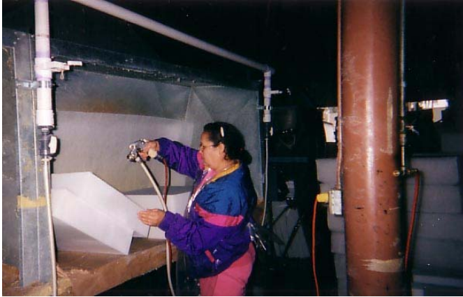
Figure 4-6. Foam Fabrication Operation