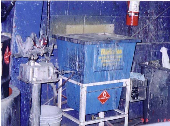
Figure 3-5. Spray Gun Cleaner at Autobody Shop #1

Case Study for Autobody Shop #1. Autobody Shop #1 is located in Santa Monica, California. It is one of a chain of 10 body shops located in Southern California. Like other body shops, the company repairs cars and paints them as part of their process. The company uses High Pressure Low Volume (HVLV) spry guns and the guns are cleaned in an enclosed spray gun cleaning unit leased by Autobody Shop #1. A picture of the gun cleaner is shown in Figure 3-5. A service provider maintains the equipment, supplies the cleaning solvent and disposes of the waste. It is likely that the company was using a solvent containing PCBTF in the cleaning operation.