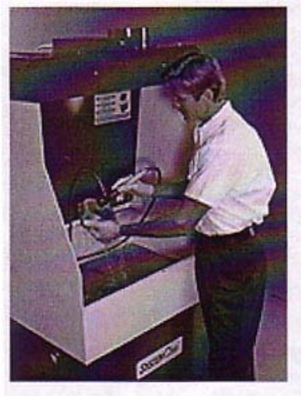
Figure 3-7. PCBTF Cleaning System

A picture of a typical repair and maintenance cleaning unit designed for use with PCBTF is shown in Figure 3-7.