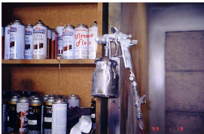
Figure 3-3. Typical Spray Gun

Autobody shops apply their coatings most often with spray equipment. A typical spray gun used in an autobody shop is shown in Figure 3-3. At certain times of the year, when the weather is cold, for instance, the coating does not flow through the equipment as easily. Thinners are used by all autobody shops to thin the coatings so they flow properly during application. Thinners are also referred to as reducers or retarders. Some companies supply slow, medium and fast retarders that are used at different times of the year depending on the weather.