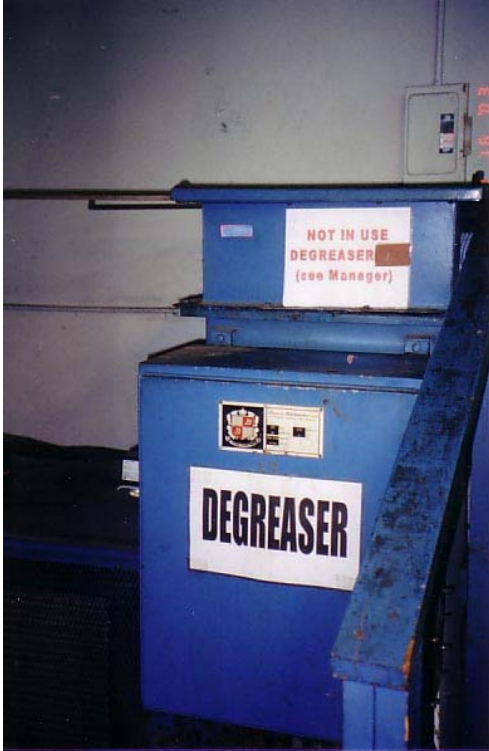
Figure 4-1. Typical Open Top Vapor Degreaser

condenses on the colder part and carries the contaminants into the liquid bath. The vapor zone always contains clean solvent. At times, the parts are cleaned in the liquid solvent as well as in the vapor zone, depending on the cleaning application. When the solvent is too contaminated for further use, the solvent is changed out.