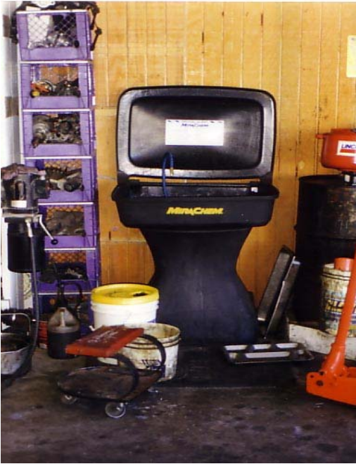
Figure 2-1. Typical Parts Cleaner

this limit was reduced further, to 25 grams per liter VOC. Prior to the regulation, nearly all repair and maintenance cleaning was performed using mineral spirits. After the regulation became effective, nearly all of the repair and maintenance cleaning in the South Coast Basin was performed with water-based cleaners. A typical parts cleaner which is sometimes called a sink-on-a-drum that uses a water-based cleaner is shown in Figure 2-1. The water-based cleaner is stored in the drum below the sink and it is pumped into the sink for cleaning. The sink contains a drain and the water-based cleaner flows through the drain to the drum below.