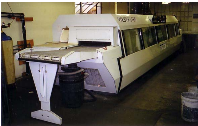
Figure 4-2. Cleaning System at Nameplate Manufacturer

A picture of the water-based cleaning system is shown in Figure 4-2. The capital cost of the system was $128,000. Assuming a five percent cost of capital and a 10 year equipment life, the annualized cost was $13,440.