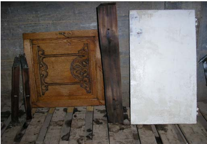
Figure 6-8. Items Before Applying Strippers at Strip Joint

A picture of these items before stripping with #B96 is shown in Figure 6-8.