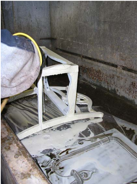
Figure 6-7. Items in Flow Tray at Sunset Strip

A picture of the items in the flow tray at Sunset Strip is shown in Figure 6-7.