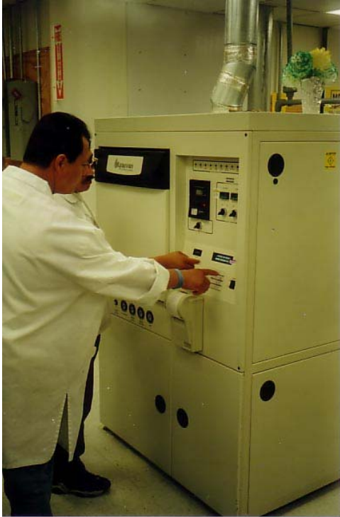
Figure 4-5. Aerospace Subcontractor Cleaning System

In the year prior to the conversion, the cost of the TCA purchased for the printed circuit board operation was $25,000. If NPB were used instead of TCA, the cost of purchasing the NPB would be the same as the cost of purchasing TCA or higher. The cost of the D.I. water used in the second commercial machine was $4.