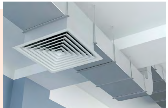
Ventilation Strategies to Control COVID-19 Transmission in Skilled Nursing Facilities Part 1 | Part 2

Staff also presented a webinar on “Respiratory Protection Programs in Long Term Care Facilities During the COVID-19 Pandemic” to 390 staff in long term care settings statewide to assist them in developing or refreshing their respirator programs to better protect their staff. The webinars were followed by question-and-answer sessions and opportunities for phone or e-mail consultations on improving their respiratory protection programs and ventilation practices.