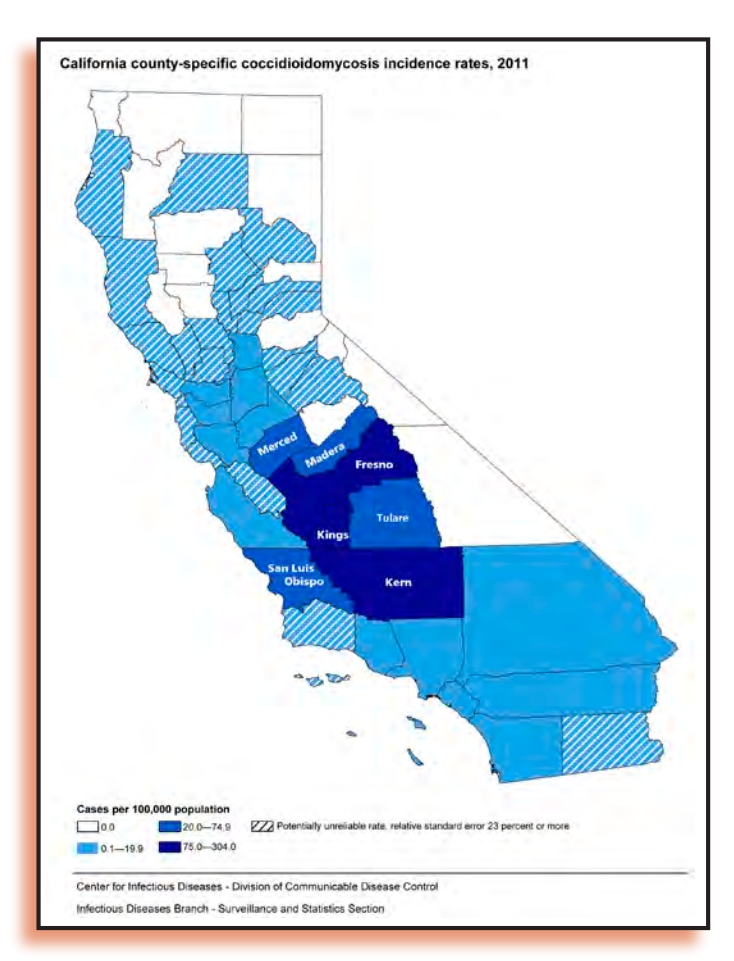
California county-specific coccidioidomycosis incidence rates, 2011

Highly endemic counties, i.e., those with the highest rates of Valley Fever (more than 20 cases per 100,000 population per year), are Fresno, Kern, Kings, Madera, Merced, San Luis Obispo, and Tulare. Other counties or parts of counties also have the fungus present.