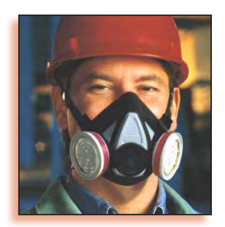
Half-mask respirator (APF=10)