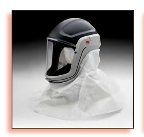
PAPR with helmet (APF=1000)