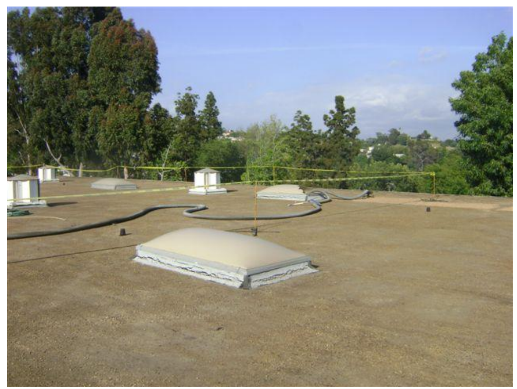
Exhibit 2. The work area on the roof.