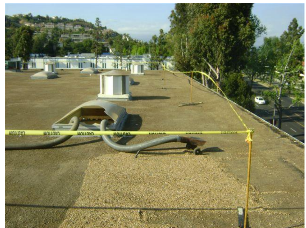
Exhibit 4. The incident scene.