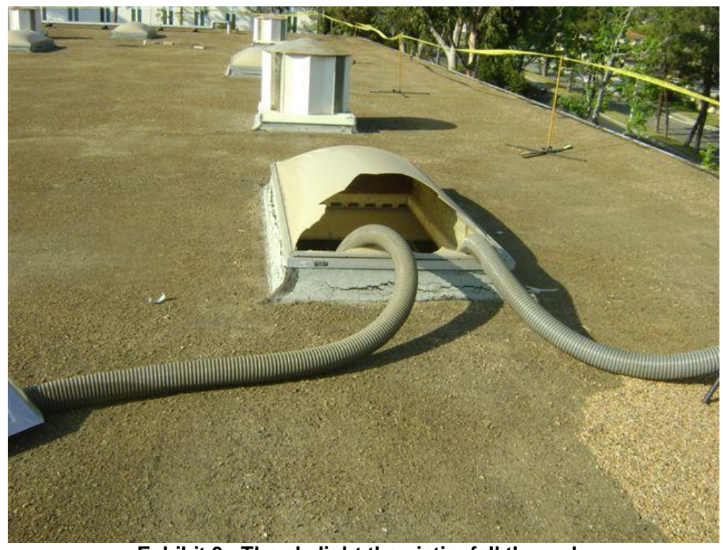
Exhibit 3. The skylight the victim fell through.