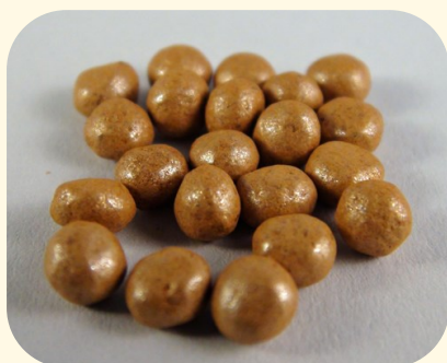
Example of Ayurvedic Pill