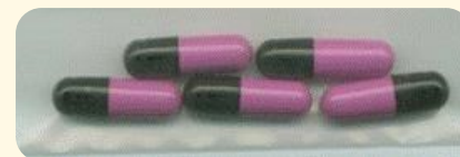
Example of Ayurvedic Capsule

For immediate concerns about poisoning call the California Poison Control System at 1-800-222-1222.