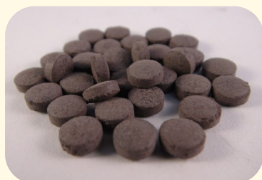
Example of Ayurvedic Pill