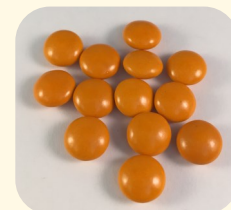
Example of Ayurvedic Pill

Ayurveda is a medical system from India that is used around the world. Herbs are used in Ayurvedic remedies to promote health or treat disease. These remedies come from Ayurvedic practitioners, from stores or online, and from the United States and other countries.