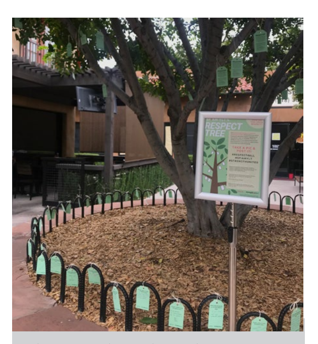
Photo: Strength United created a "Respect Tree Campaign" by engaging community at libraries, schools, and businesses.

The relationships that people have with each other in the community is a wellknown protective factor for youth and adults, and is an indicator of greater community support. C2H participants reported in both the CIS and interviews that they built relationships in their communities because of their connection with the C2H project. Community stakeholders noticed an increase in community connectedness such as building trust with churches and religious communities, more robust participation in community actions, and better connecting the community to resources for services. In addition, stakeholders noticed increased online conversations through social media and the leveraging of the #MeToo moment during the last year of the projects.